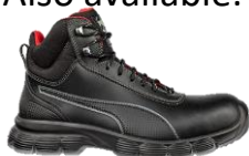
CONDOR BLACK MID 630101